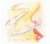
Dust can cause breathing problems