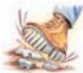
Slippery/uneven surface can lead to slips, trips and falls