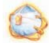
Respirator as needed