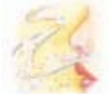
Dust or mold can cause breathing problems