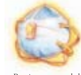
Respirator as needed