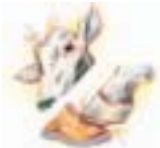
Animal movement can cause injury