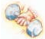
Weight of feed or cart can strain muscles