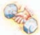
Weight of PTO shaft can strain muscles